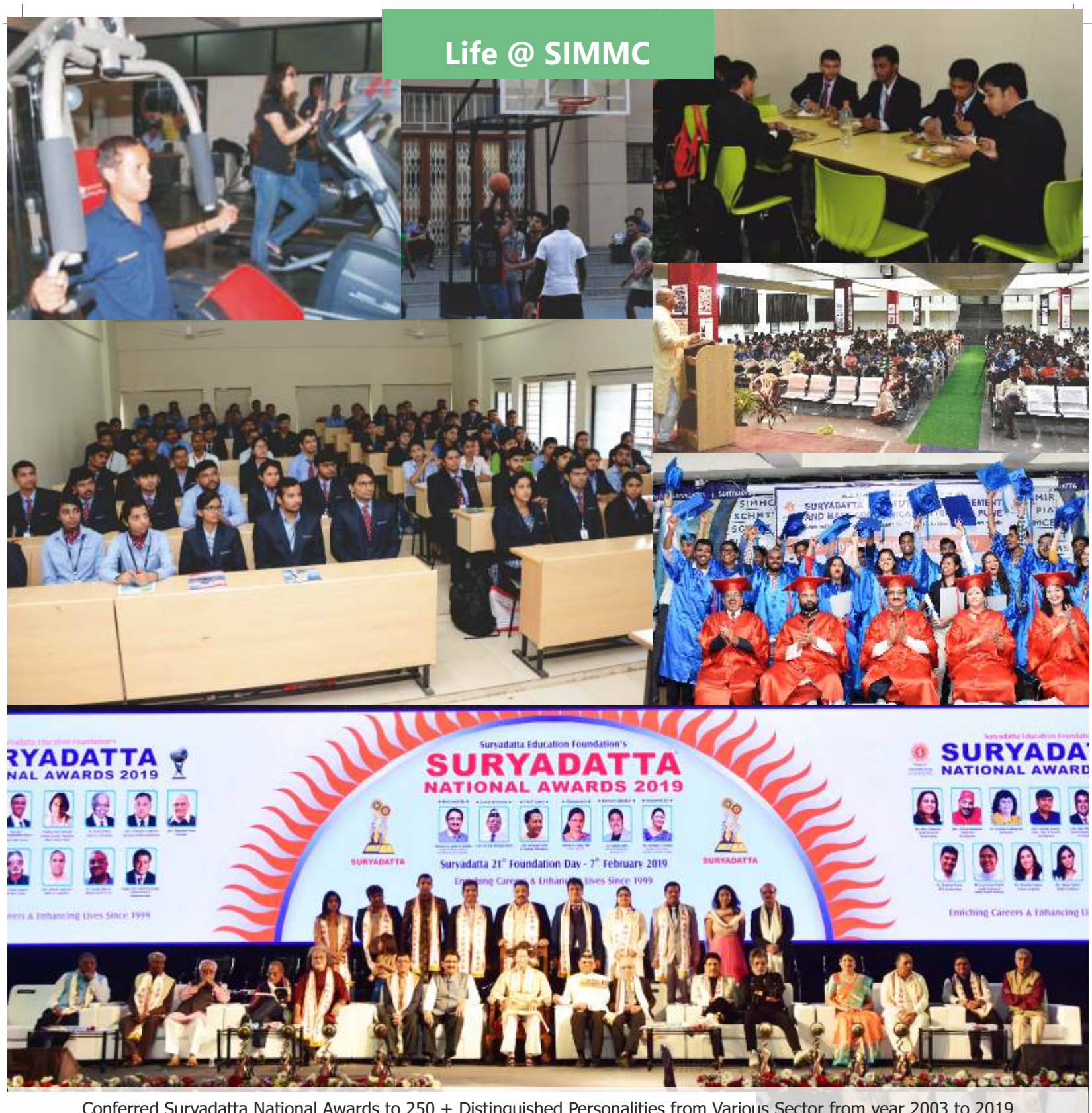
Conferred Suryadatta National Awards to 250 + Distinguished Personalities from Various Sector from year 2003 to 2019 .....more details refer www.simmc.org